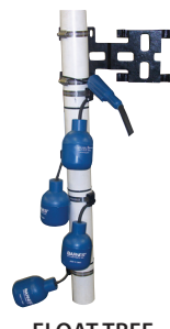
FLOAT TREE LEVEL CONTROL